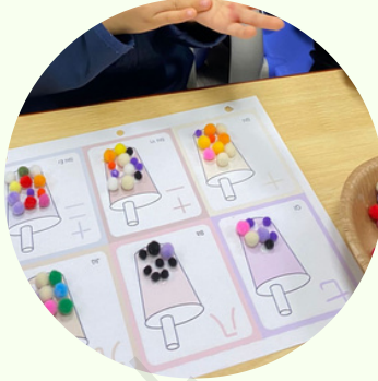
Cantonese + Mandarin 1